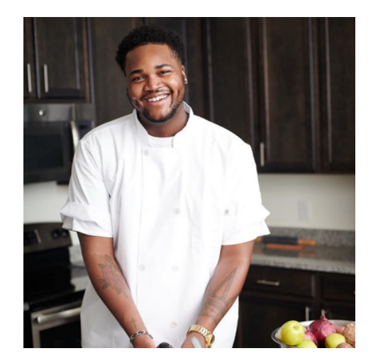
Keep It Sexy

For booking please email: dk.goodeats@gmail.com