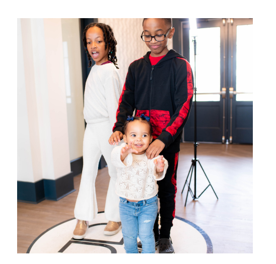
The M Experience

The JD Experience is a family based business whose goal is to make your event one to remember! Services include interactive photo-booths rentals that will take your event to the next level and create a lasting impression for your guest. You may select from either a XL 360 photo-booth, Mirror photo-booth, or both! Each photo-booth can be customized to include custom filters, backdrops, animations, and more!